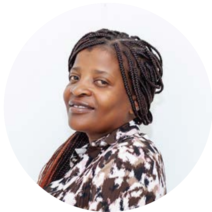
Fungai Property Consultant