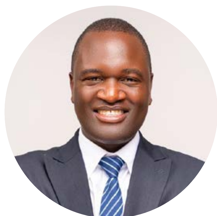
Aaron Group CEO