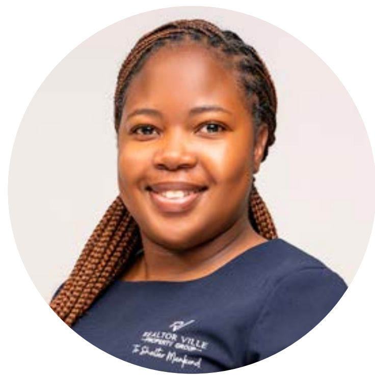
Mercy Property Manager