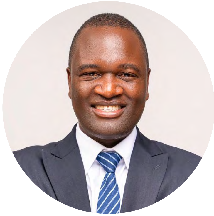
Aaron Group CEO