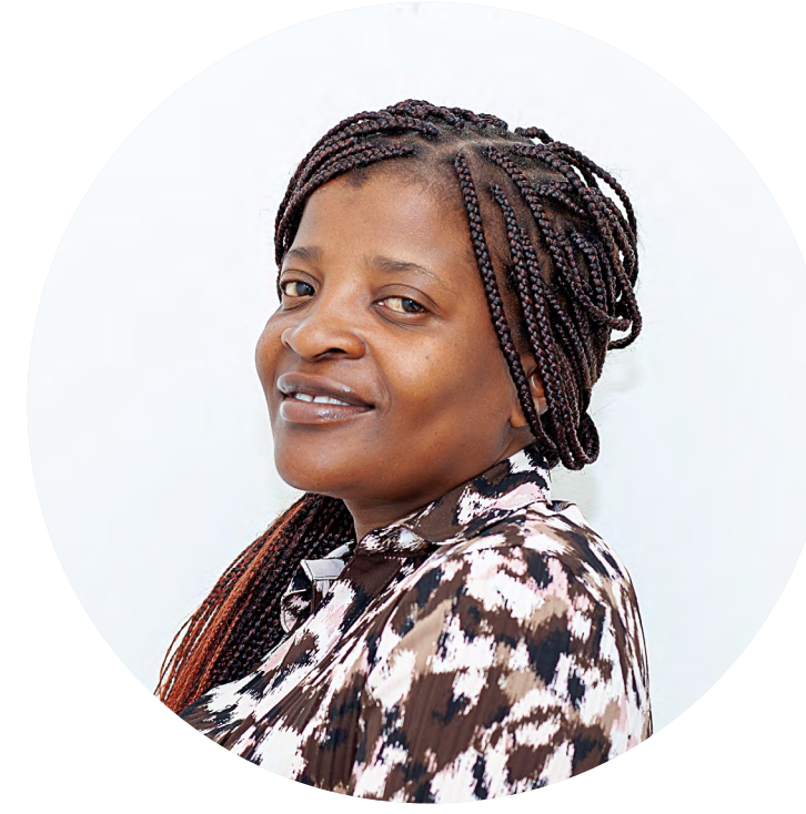
Fungai Property Consultant