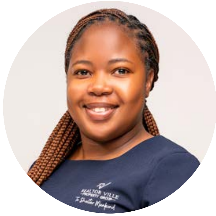
Mercy Property Manager