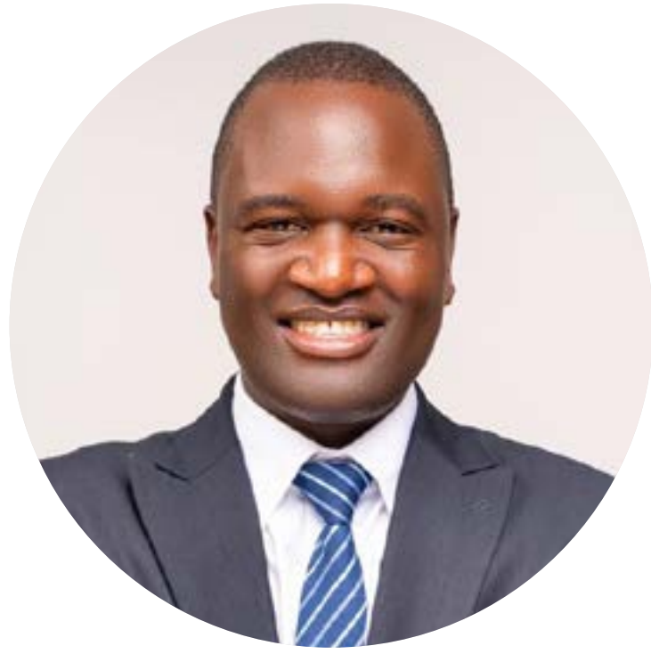
Aaron Group CEO