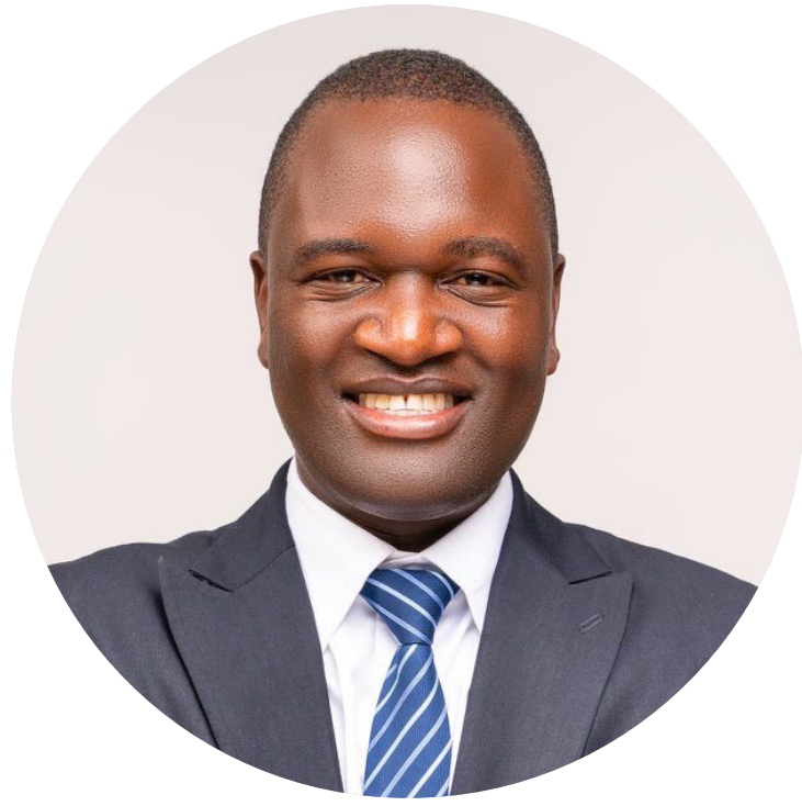
Aaron Group CEO