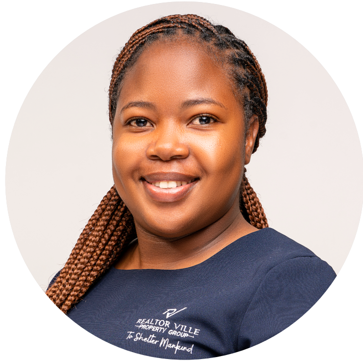
Mercy Property Manager