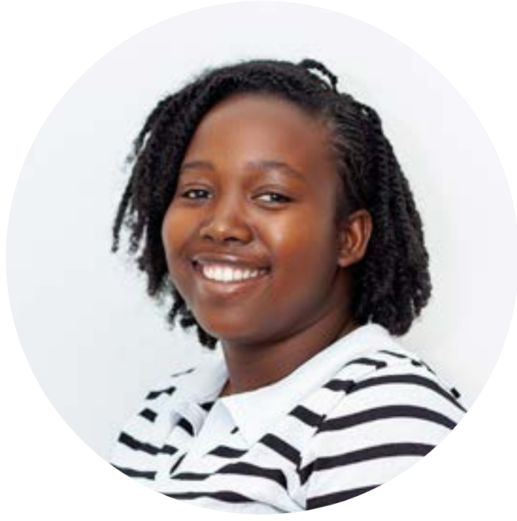
Unotidaishe Property Consultant