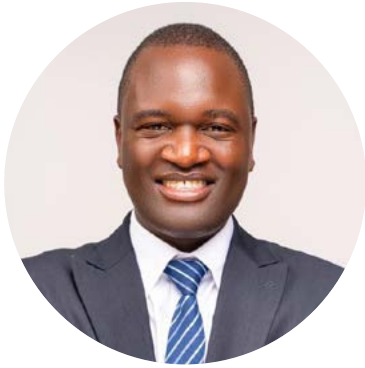
Aaron Group CEO